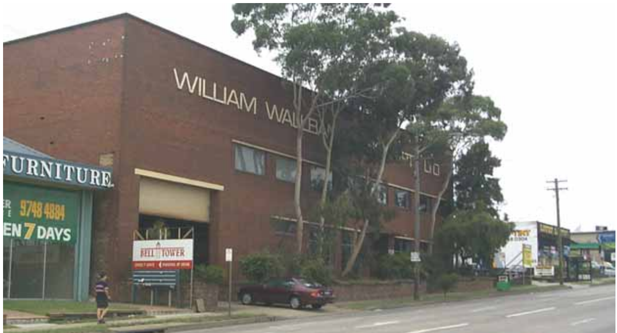
185 to 187 Parramatta Road. (Frontage) 40.5 meters