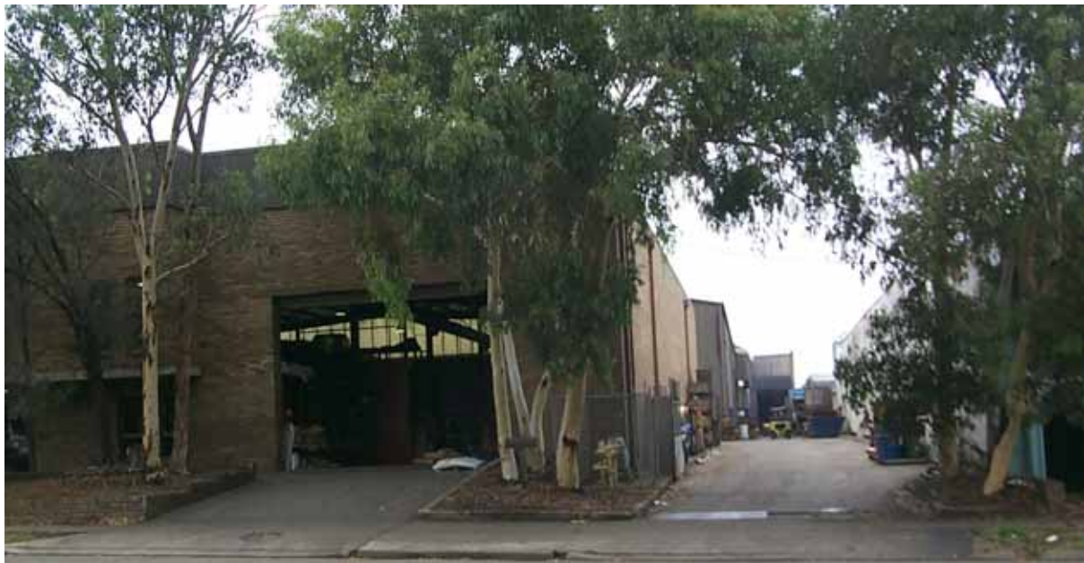
130 Adderly Street. (side driveway for loading & rear access to entire site)

Phone: (02) 9568 1611 Fax: (02) 9568 1622 Email: sales@gerardcole.com.au Website: www.gerardcole.com.au