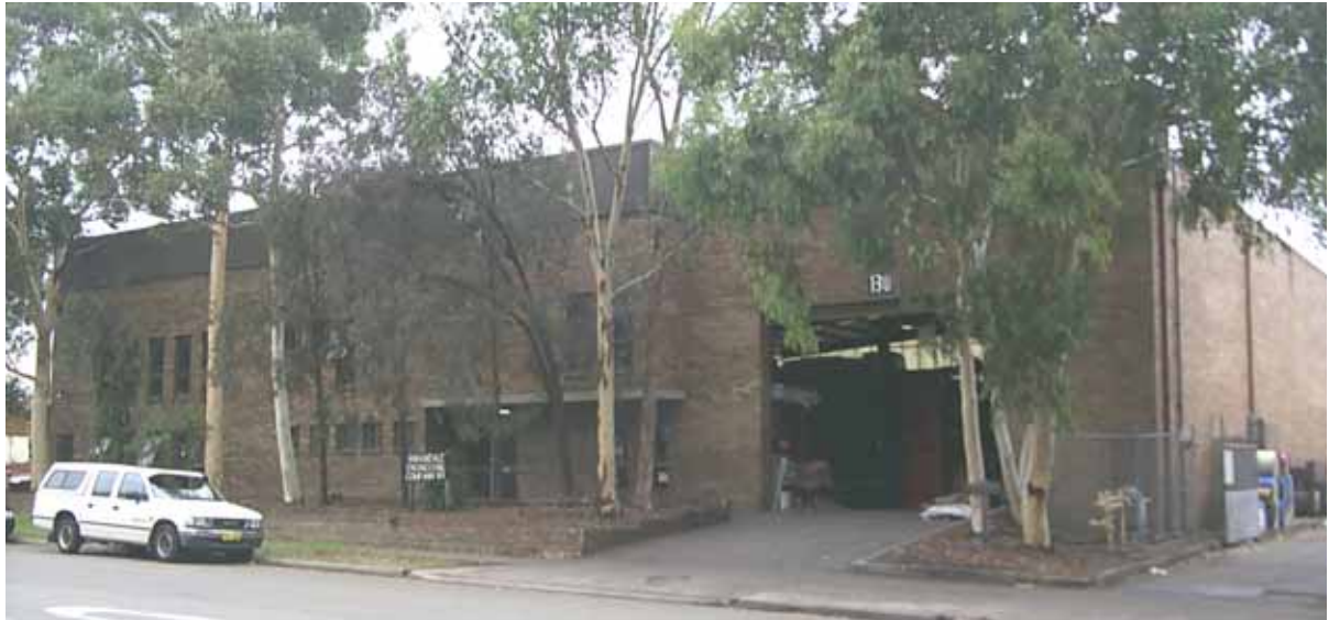
130 Adderly Street, Auburn (modern high clearance factory approx. 1700sqm)