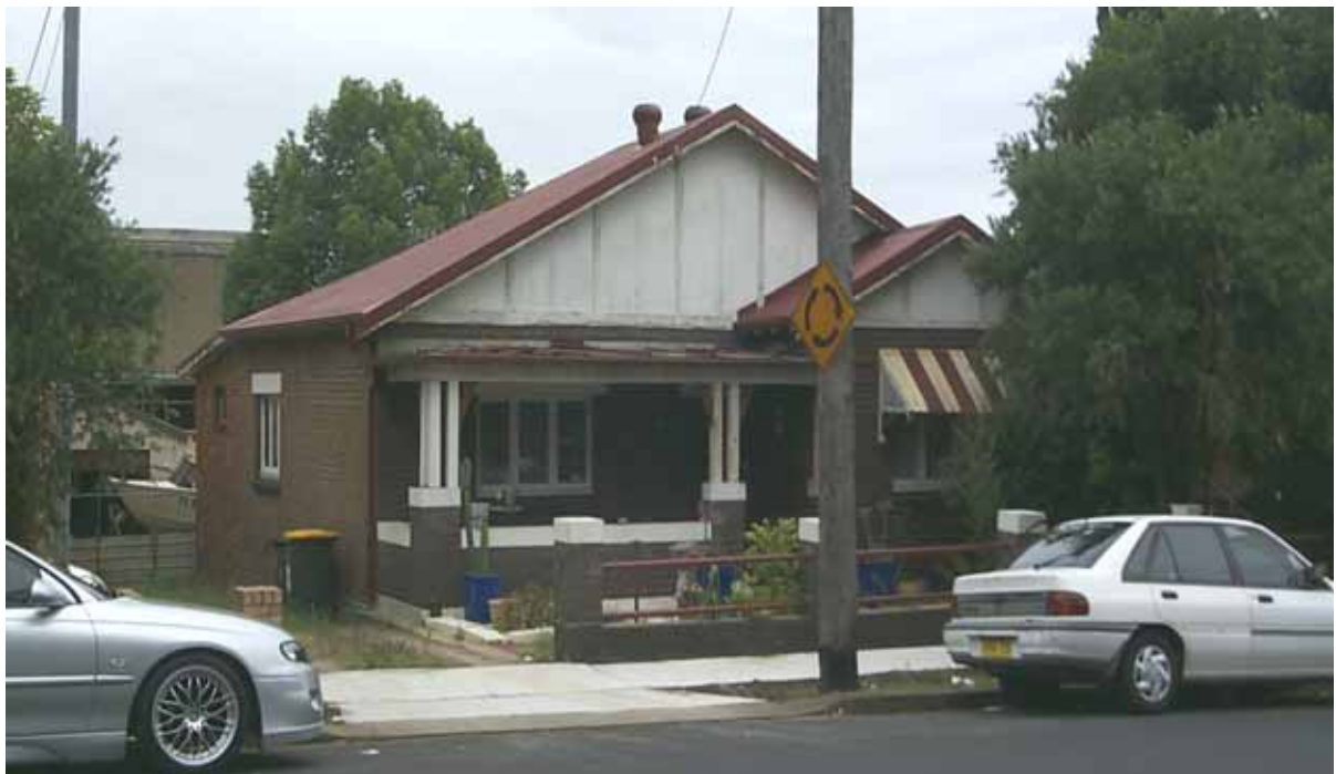
Stubbs Street, Auburn (residential house 13.41meter frontage, 53.6 meter depth