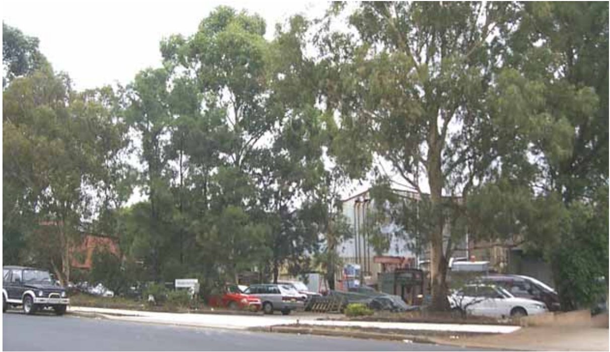
Stubbs Street, Auburn (Parking Area) 54 meter frontage